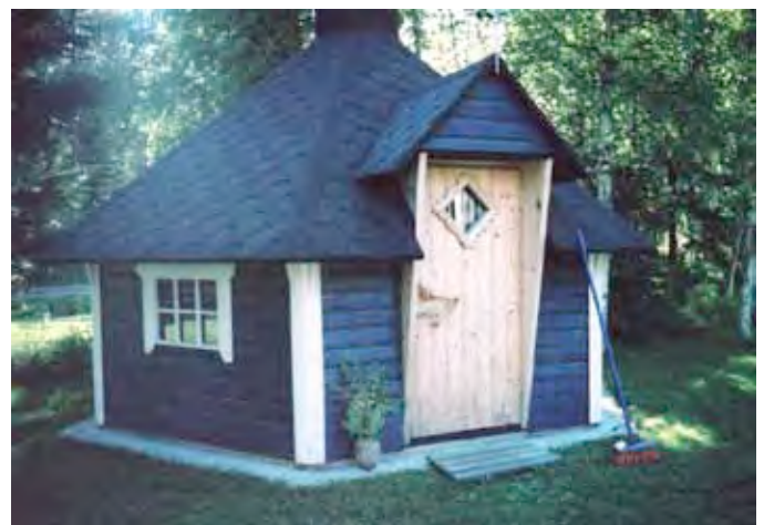
Little building, a huvimaja , at the Nordstrom home