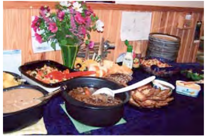
Beautiful Finnish food at Pikko and Ari's home

The Finns are the best when it comes to entertainment. The food is non-stop and delicious! I can't wait until the reunion scheduled for 2011.