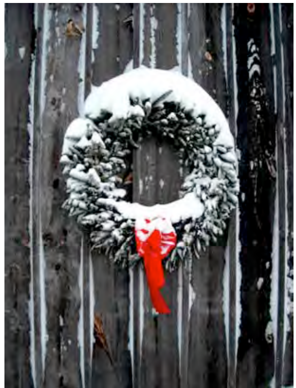
Native Holly botanical illustration, top, and wreath photo, above, by Michael Ludgate